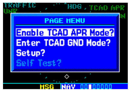
Figure 1 - TCAD APR Mode Selection

When enabling or disabling TCAD APR Mode on the GNS Traffic page, the selection does not display "Disable TCAD APR Mode?". The selection always displays "Enable TCAD APR Mode?". Refer to Figure 1.